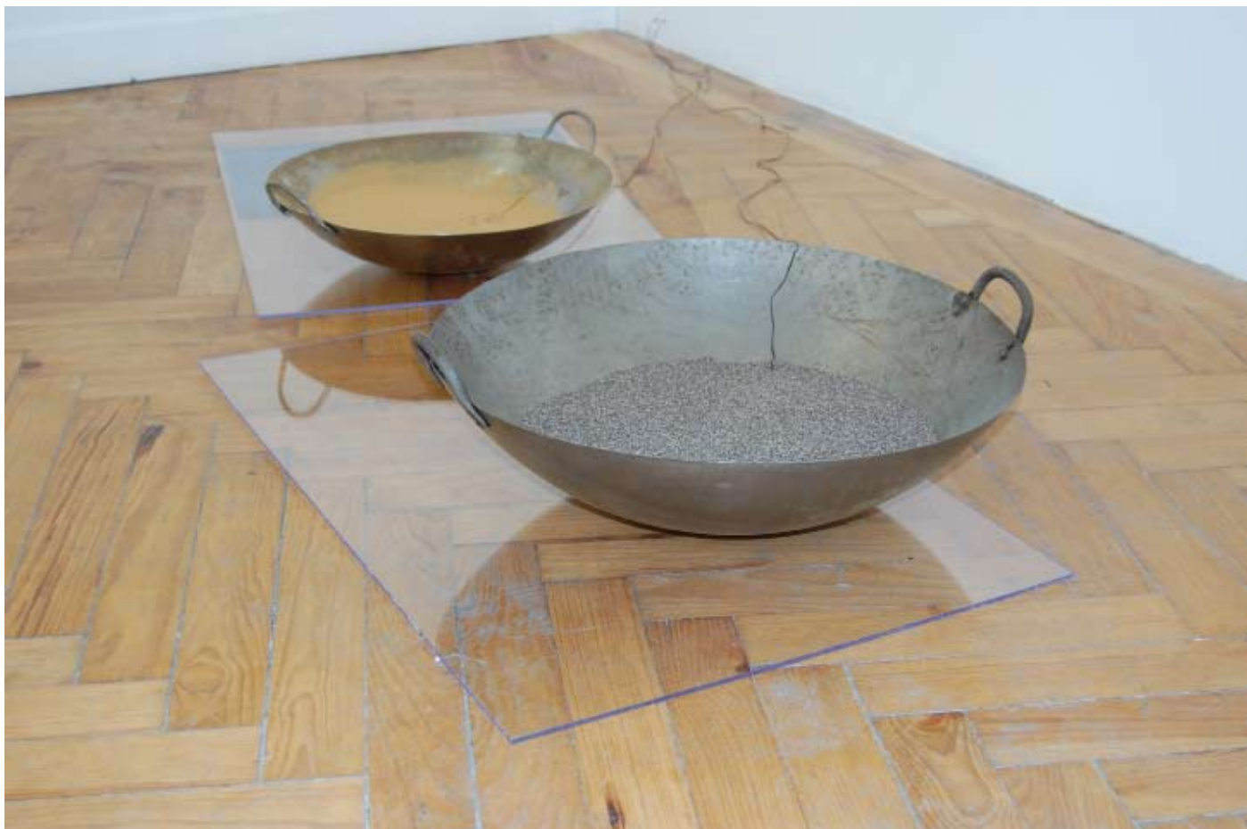
Three large bowls 2007 variable dimension Two woks, pepper, pepper and ash, inkprint, speakers, audio, acrylglass.