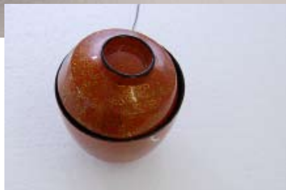
Ash (Desert) 2007 variable dimension Bow, ash, speaker, audio