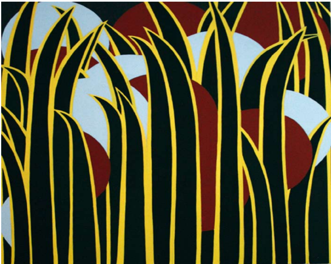
Abstraction in the jungle 2008 100 cm x 100 cm painting