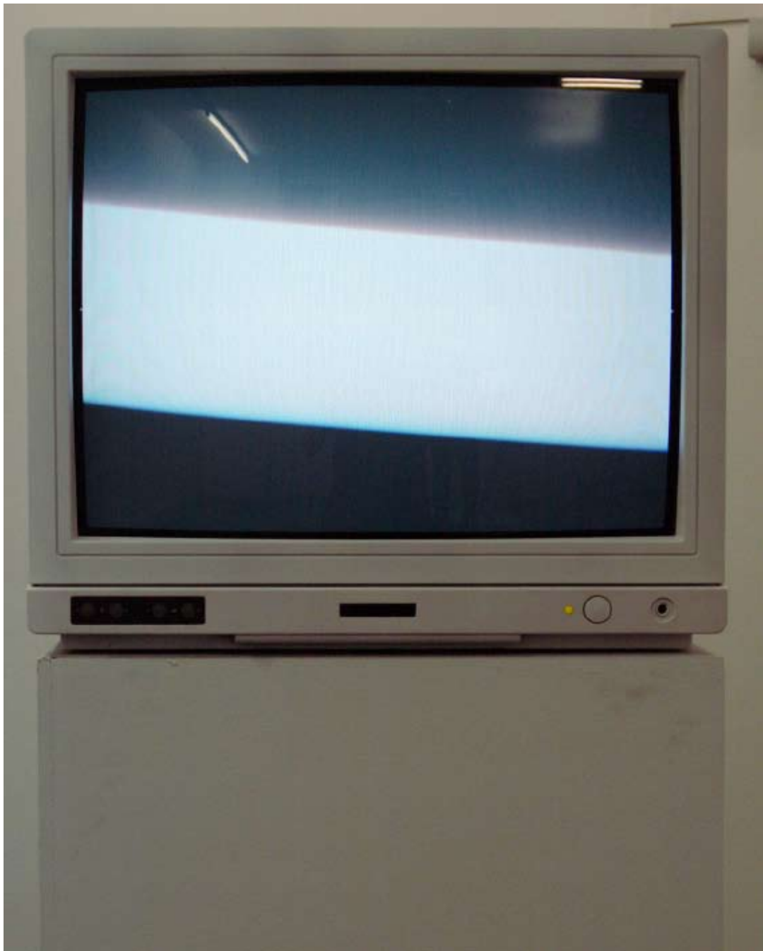
Sans titre 2008 sculpture monitor