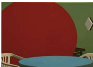
Untitled 2008 painting