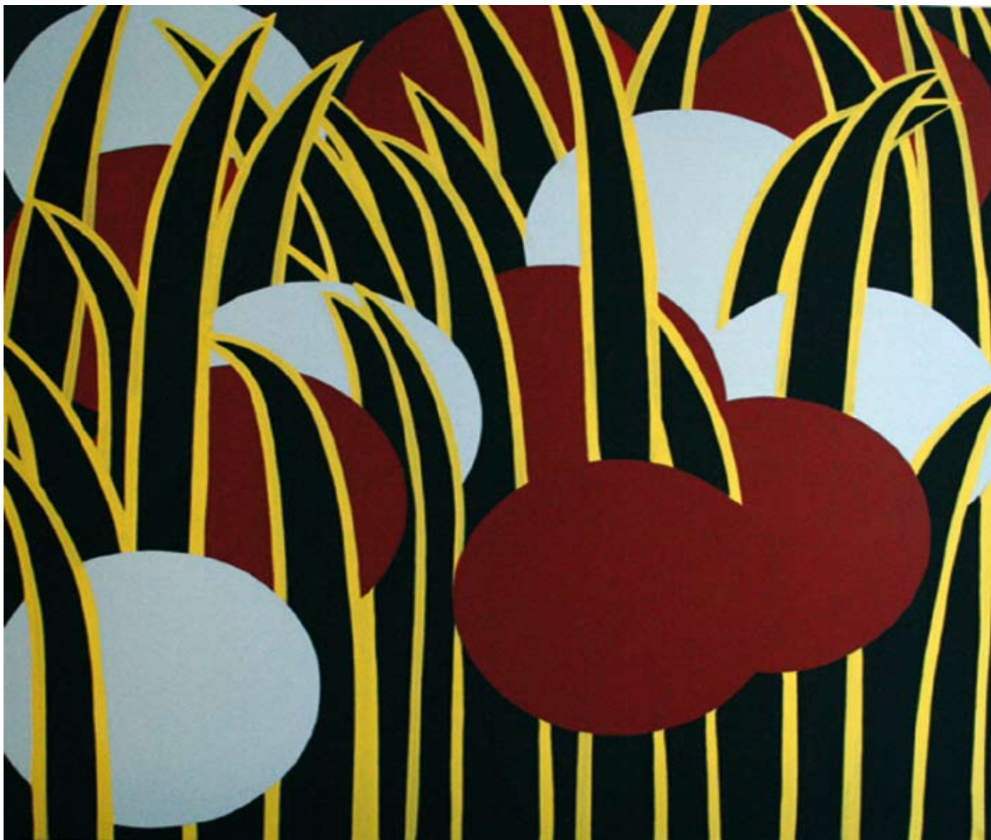
Abstraction in the jungle 2008 100 cm x 100 cm painting